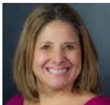
Kim Daly Communications, CLCS