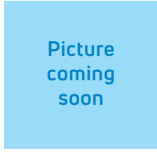
Open VP Policy, CLCS Action