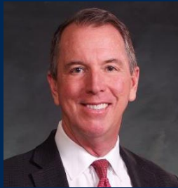
SENATOR PAUL LUNDEEN